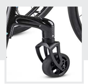
Castor wheel connection