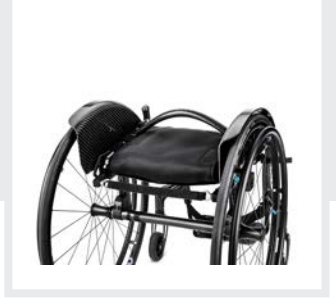
Folding back as standard feature