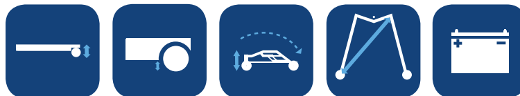
Height of legs ▼ Ground clearance ▼ Height when folded ▼ Turning diameter ▼ *Working ability ▼