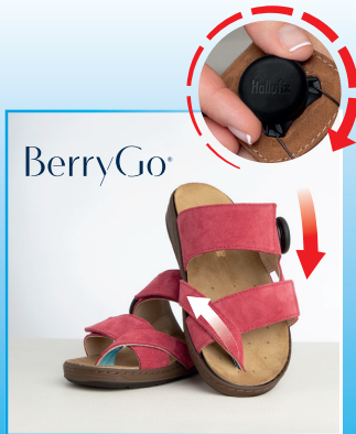
Hallux valgus (bunion) Therapy-Sandals