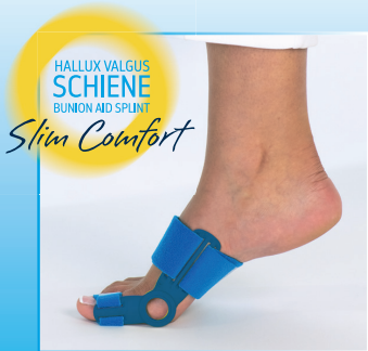
Hallux valgus (bunion) day and night Splint