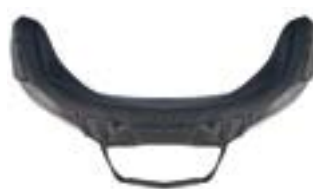
// Deep Contour (DC)