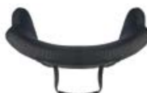
// Mid Deep Contour (MDC)