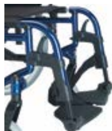
// BRU050001 Hanger angle 80°