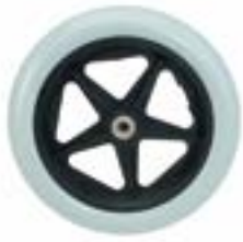
// BRU070066 Rear wheel, 12", solid