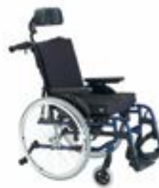
// BRU030014 Backrest, recline (0° - 30°), push handles long