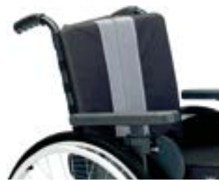
// BRU030079 Backrest sling, Nylon, vented, adjustable, 4 straps, black