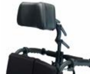
// BRU030080 Headrest, Skay, height- and angle-adjustable, 260 x 130 mm