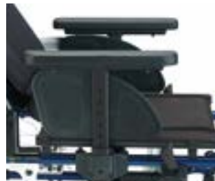
// BRU040052 Single post sideguard, armpad (300 mm), tool height- and depth-adjustable, removable