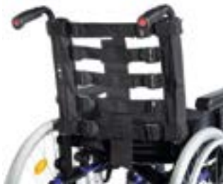
// JAY08001 JAY Shape back