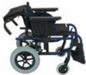
// BRU030101 Backrest, half-folding