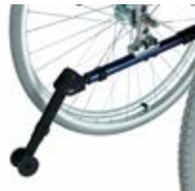
// BRU090042 Anti-tip tubes, plug-in, flip-up, left