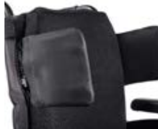
// JAY080011 JAY Shape lateral support (LxH) 100 x 120 mm (pair)