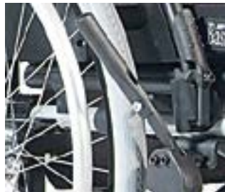
// BRU060010 Brake lever extension, knee-lever brake, fold-down