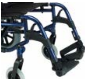
// BRU050002 Hanger angle 70°