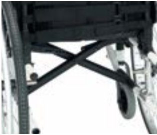
// BRU010025 2 arm cross brace