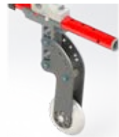
// BRU090010 Transit wheels