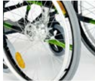
// BRU070068 Rear wheel, 24", solid, drum brakes, 36 spokes (silver), cross-wise spokes, handrim Alu anodized-silver