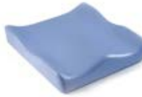
// JAY020003 JAY Soft Combi P Cushion (without cover)