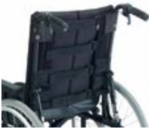
// BRU030078 Backrest sling, Nylon, adjustable, 4 straps, black