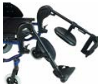
// BRU050009 Hanger, aluminium, flip-up (0° - 90°), swing away, left (ELR)