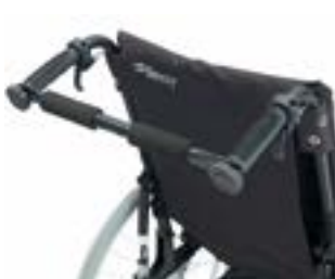
// BRU030401 Stabilizer bar, swing away