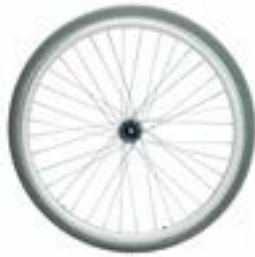
// BRU070070 Rear wheel, 22", solid, 36 spokes (silver), cross-wise spokes, handrim Alu anodized-silver