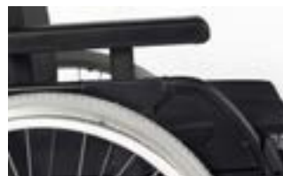
// BRU040054 Armrest with armpad (300 mm), height-adjustable, short/long