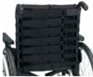
// BRU030077 Backrest sling, Nylon, adjustable, 7 straps, black