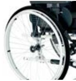
// BRU070053 Rear wheel, 24", solid, black tires, 36 spokes (silver), cross-wise spokes, handrim Alu anodized-silver