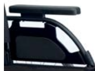
// BRU040053 Armrest with armpad (300 mm), tool height- and depth-adjustable