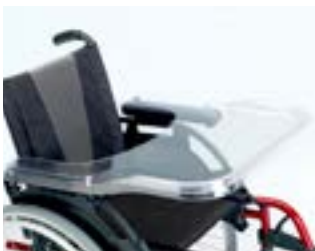
// BRU090011 Tray, push-fit