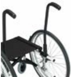
// BRU030122 Backrest, fixed, push handles long, lumbar curve 10°