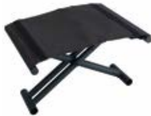
// BRU010026 3 arm cross brace