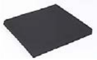
// BRU020066 Seat cushion, foam (medium soft), cover black, 50 mm