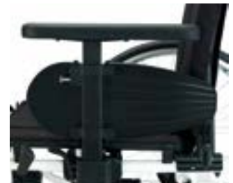
// BRU040018 Single post sideguard, armpad (300 mm), height-adjustable, tool depth-adjustable, removable