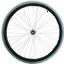
// BRU070251 Handrim cover, Silicon