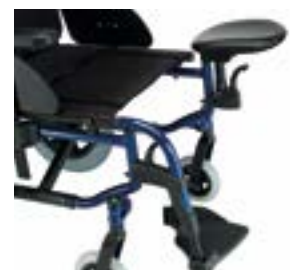
// BRU050014 Amputee support, left