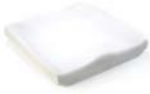
// JAY020002 JAY Basic Cushion (without cover)