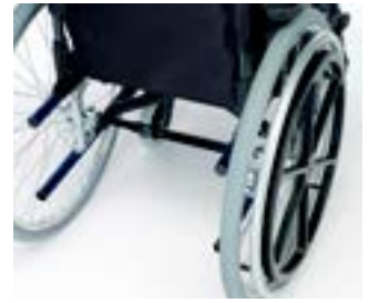
// BRU070402 Rear wheel, one-hand operation, 36 spokes, cross-spoked, right actuation