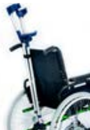
// BRU090039 Crutch holder, left