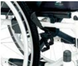
// BRU060002 Knee-lever brake