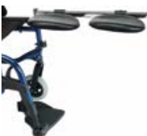
// BRU050093 Cast support, left