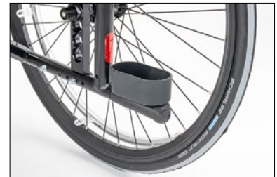
MA57 Crutch holder