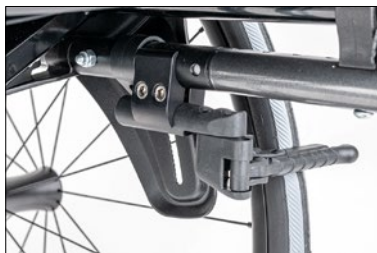
MH05 Outfront-scissor wheel lock