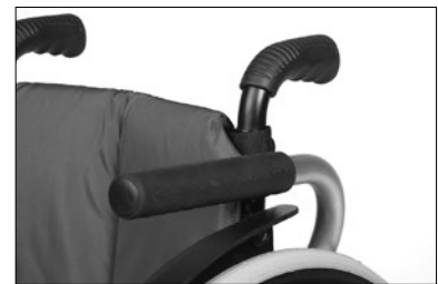
ME50 Side panel, padded