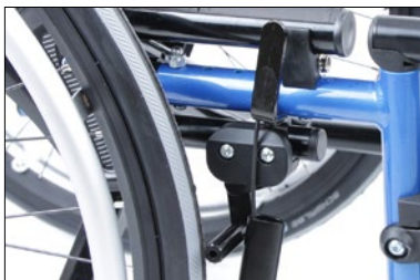
MH01 Knee lever wheel lock