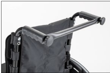
MD58 Stabiliser bar