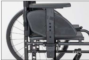
ME11 Plug-on side panel plastic