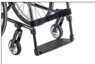
MB03 Single-panel leg supports, angle-adjustable