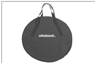
MZ58 Bag for drive wheels