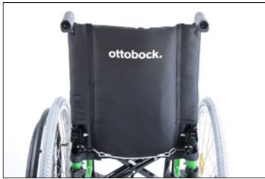
MD04 Back support upholstery Standard