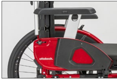
ME17 Side panel with arm support long, height-adjustable