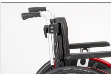
MD55 Push handles height-adjustable, removable