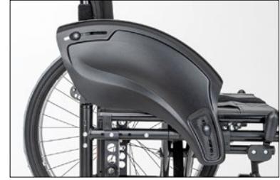
ME02 Side panel with clothing guard and against cold