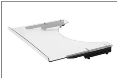
ME60 Therapy tray