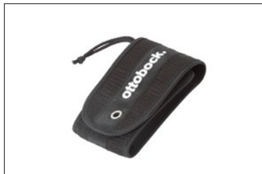
MZ59 Poket for mobile phone