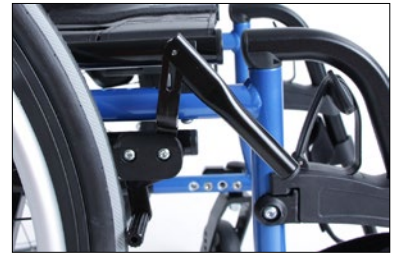
MH10 Knee lever wheel lock extension