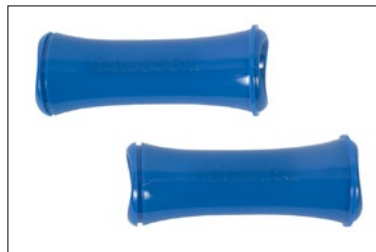
MZ89 Protection for quick-release-axle