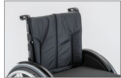
MD05 Back support upholstery, breathable