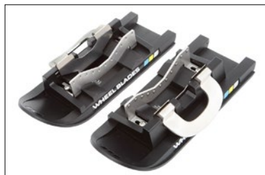
MZ92 Wheel Blades