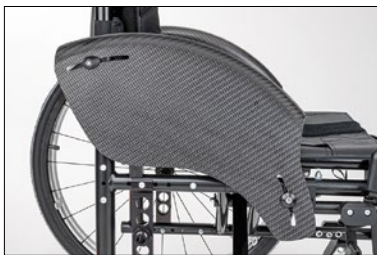
ME04 Carbon side panel