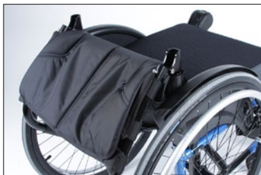
MD11 Foldable back support