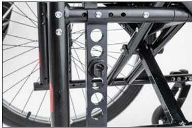
Drive wheel adapter