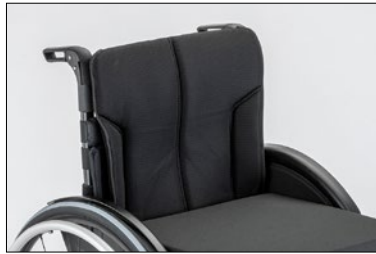
MD03 Back support upholstery, padded