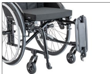
MB201 Swing away foot support bar, left