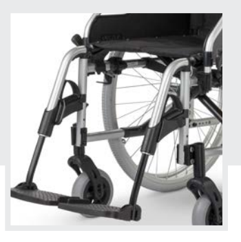
Legrests swing-away inwards and outwards