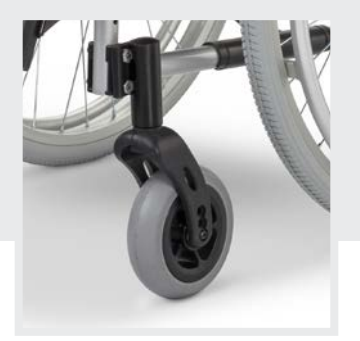
Angle-adjustable steering head