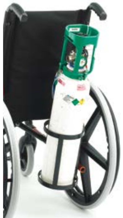
Oxygen bottle holder