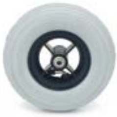
Pneumatic front castors 8" x 2"