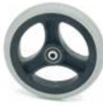
Slid front castors 6"