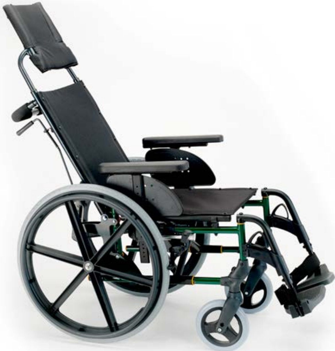
Standard configuration with upholstery recline headrest and (optional) detachable axles