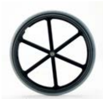
Pneumatic mag rear wheels 24"