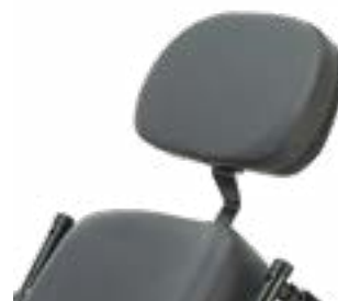
Sky headrest assembled on anatomical headrest