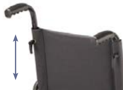
Height adjustable handles