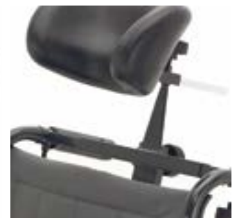
Anatomical headrest assembled on anatomical backrest