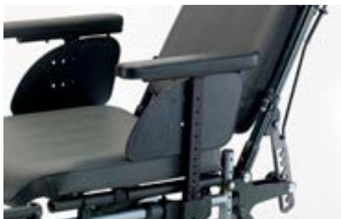
T armrests, height adjustable (with tools)