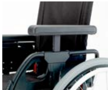
Height adjustable armrest