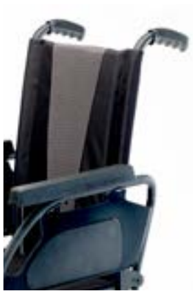
Breathable Vented upholstery