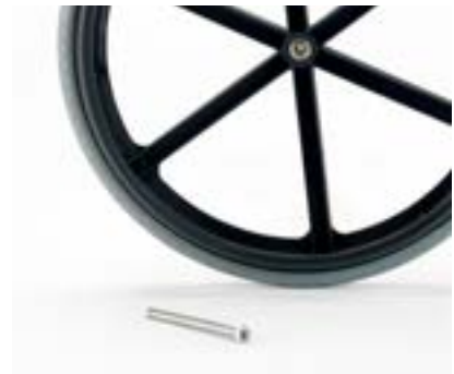
Quick release axle on rear wheels