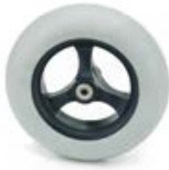
Slid front castors 8" x 2"