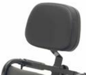
Sky headrest assembled on nylon upholstery