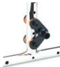
Set forward Std. position at the center of gravity (+25mm). More active

Modifying the position of the rear wheel plate we can change the distance between the front and rear wheelchair. The length of the chair can be lengthened or shortened depending on the turning radius that want to acquired. This helps to gain an more active chair, while lengthening an stable chair will be gotten.