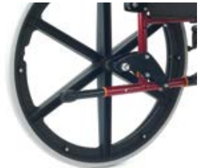
Double amputee kit