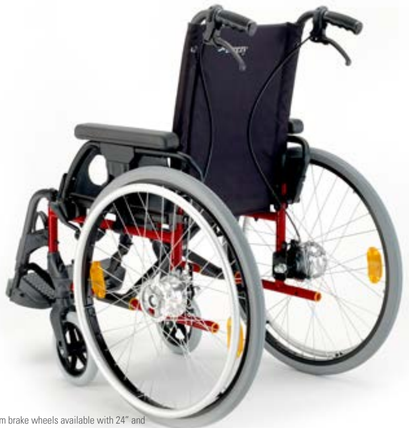
Drum brake wheels available with 24" and 12" rear wheels