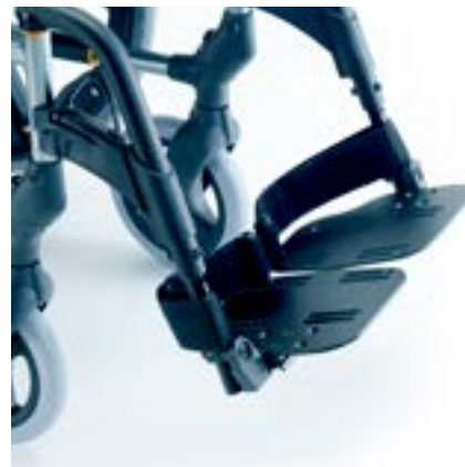
Aluminium angel adjustable footplates