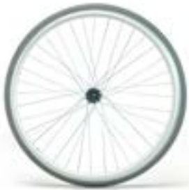
Slid or Pneumatic spoke rear wheels 24" or Pneumatic spoke wheels 22"