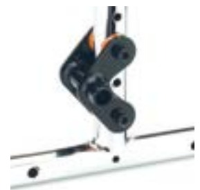
Set back Center of gravity -50mm More stable