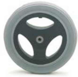
Solid or Pneumatic rear wheels 12"