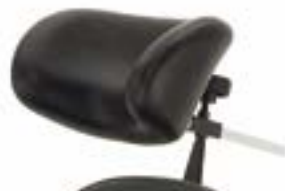
Anatomical headrest assembled on nylon upholstery