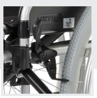
Knee lever brake