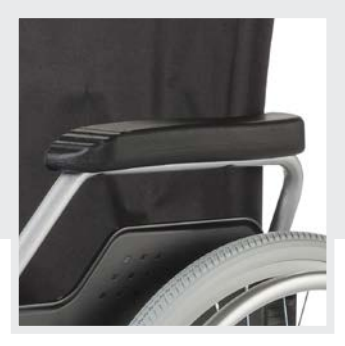
Lockable, backward-folding armrests