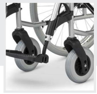
Front seat height-adjustable without swapping parts