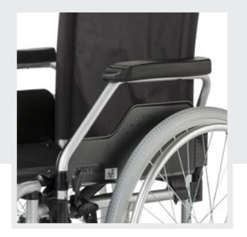
Comfort-remove side panel