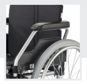
Comfort-remove side panel