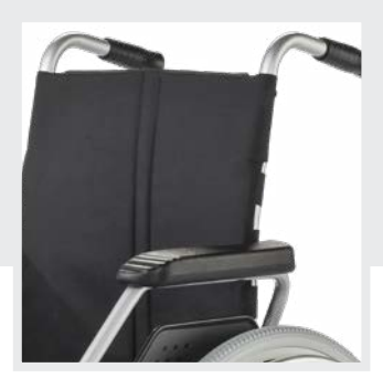
Adjustable back strap