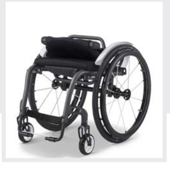
Folding back as standard feature