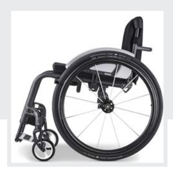
Elegant frame concept