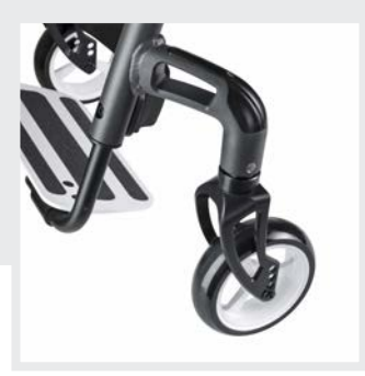
Castor wheel connection