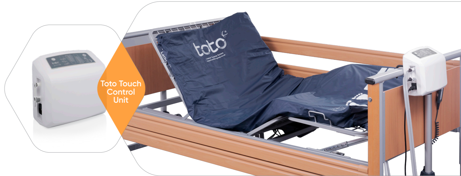
Toto Touch Control Unit

Keeping patients moving is just one step of the seven-step care plan, aSKINg 1 .