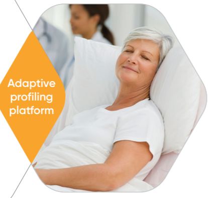
Adaptive profiling platform