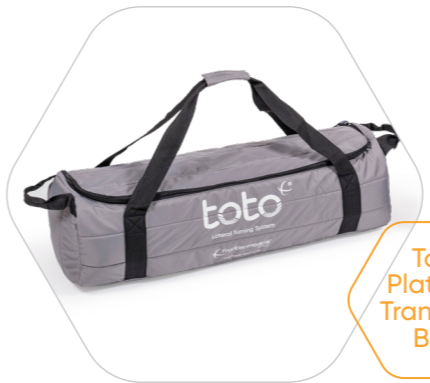
Toto Platform Transport Bag

Toto lateral turning system has a two year warranty