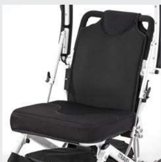
Comfort seat system