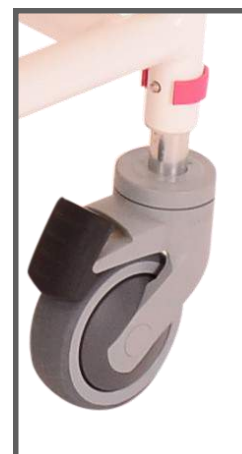
Surcharge for the chair delivered with 1 direction fixed wheel: Art. no.: 800157

It is also possible to get a direction fixed castor to an existing wheel chair as an accessories.