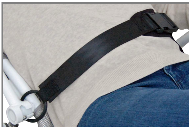
Hipbelt with click buckle Art. no.: 800404