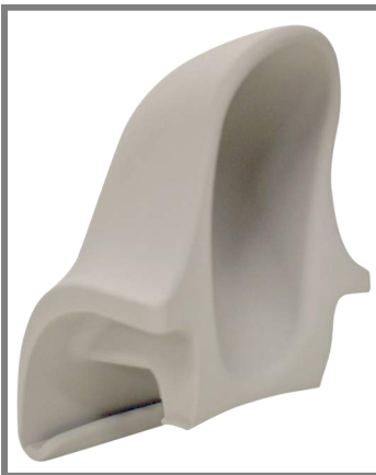
Nielsen Line Splash guard Art. no.: 313047

The urin funnel is used by placing the narrow end facing down towards the toilet.