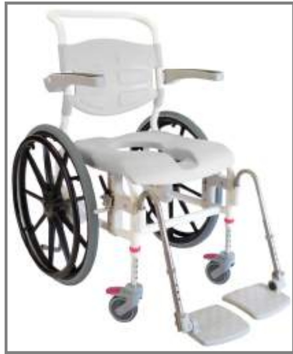
Nielsen Line Self-propelled Shower/commode w/plastic backrest Art no.: 313031+313040+313034