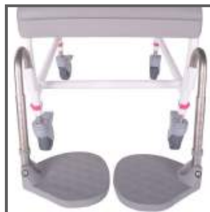
Footrests: short: art. no. 310510 extended: art. no. 310283 Reinforced: art. no. 310275

And a reinforced one in standard length.