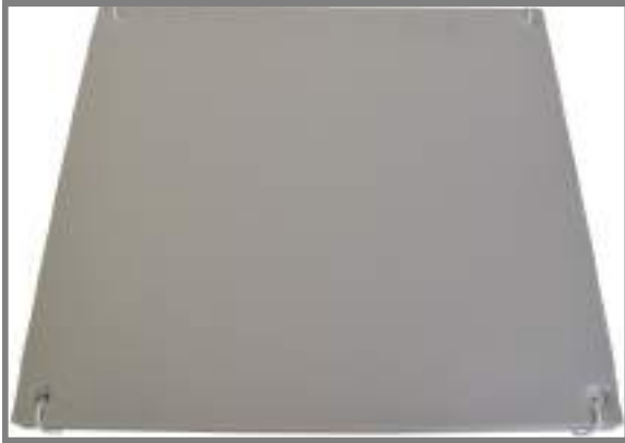
Supersoft foam cushion Without hole Art. no.: 330022