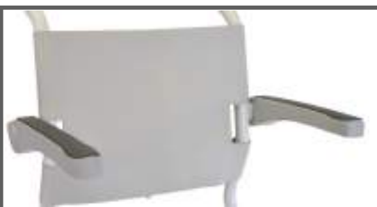
Soft backrest Vare nr.: 313045

The splash guard is mounted on the seat.