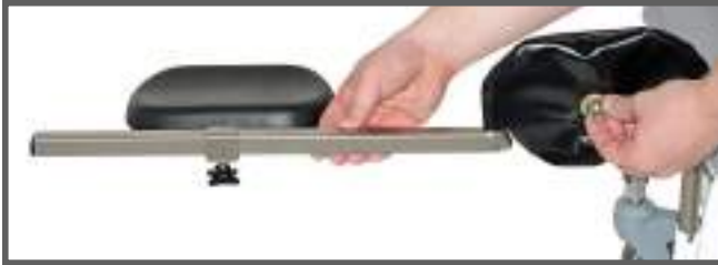
Legrests with elevation, set, art. no.: 310052 Legrest with elevation, right, art. no.: 310053 Legrest with elevation, left, art. no.: 310054