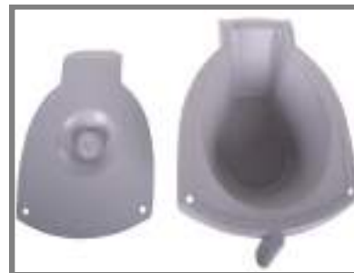
Bucket with lid, intimate Art. no.: 310048