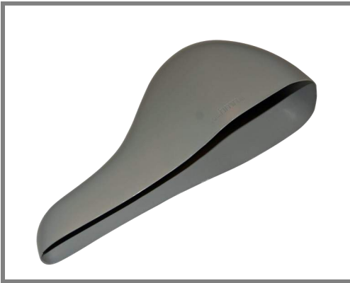
Urine funnel Art. no.: 148861