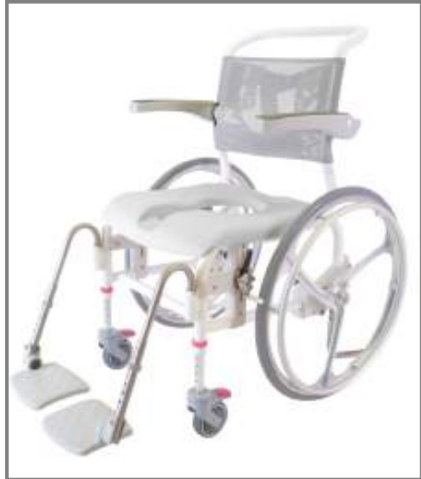
Supplements for magnesium wheels, mounted Art. no.: 313044+313034

On Nielsen Line shower / commode chairs its possible to mount 24" wheels. This enables the user to become Self-reliant and handle showering and toilet by themselves.