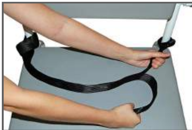
Hipbelt with velcro Art. no.: 330019

To prevent the user from being bothered by the click buckle it is fitted with a neoprene piece.