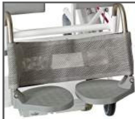
Calf support Art. no.: 310226

The calf support is made with velcro which makes it depth adjustable. It supports the entire lower leg which provides safety for the user.