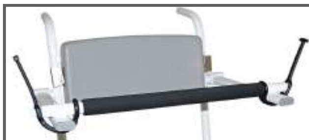
Crossbar Art. no.: 310228

It provides good support and extra security for the user.