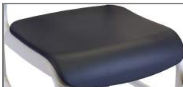
Cover in PU foam Art. no.: 313042

The cover for Nielsen Line chair covers the entire seat, and is made of soft PU foam.