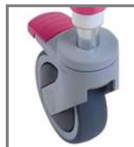
125 mm Wheels for Nielsen Line Vare nr.: 800538

The wheels are mounted on telescopic legs so the chairs can be adjusted in height.