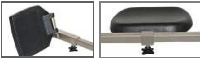
Footrest plate: Right, Art. no.: 310085 Left, Art. no.: 310086 Extra calfrest in PU foam Art. no.: 310358