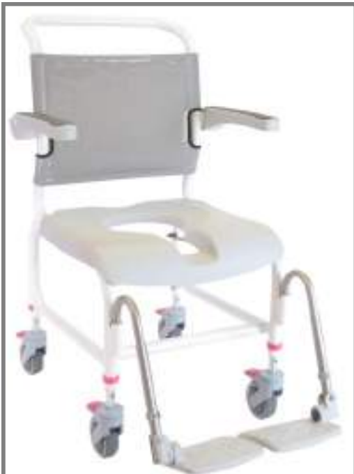
Nielsen Line Shower/commode w/netweave backrest Art no.: 313030