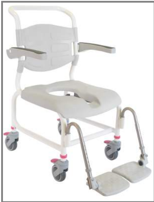
Nielsen Line Shower/commode w/plastic backrest Art no.: 313031