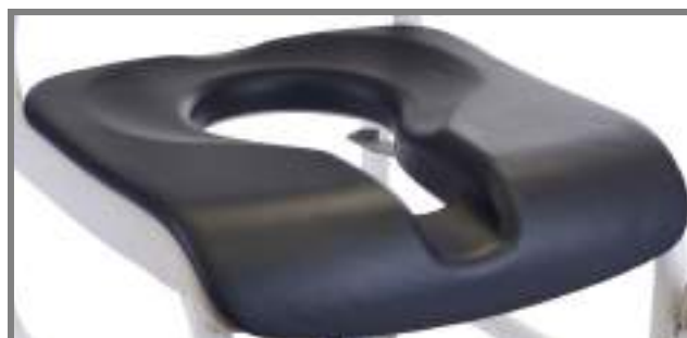
Soft seat in PU foam Art. no.: 313043

This seems also more warmly for the user and provides a better experience of sitting on a shower / commode chair.