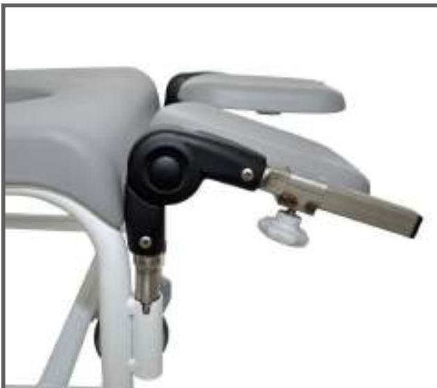
Amputation support: Amputation support, right, Art. no.: 800343 Amputation support, left, Art. no.: 310870

With these, you can adjust the angle and the position of the calf rest to achieve optimal support.