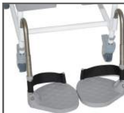
Footrest with heel straps Art. no.: 310285

With heel straps the footrests can still be pushed aside.