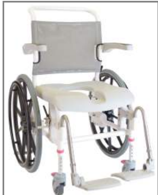
Nielsen Line Self-propelled Shower/commode w/netweave backrest Art no.: 313030+313040+313034