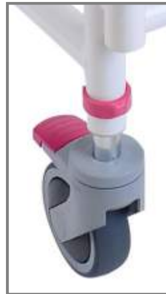
125 mm wheels mounted instead of 100 mm wheels. Art. no.: 313048

The chair can also be delivered with 125mm wheels.