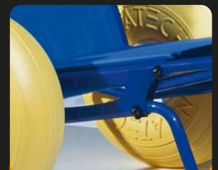
Quick lock system