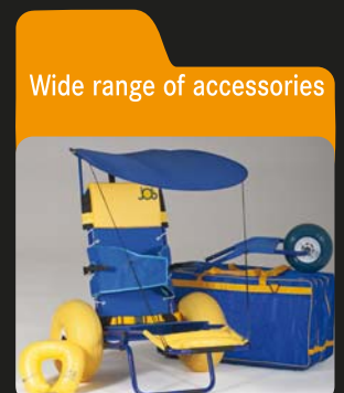
Wide range of accessories