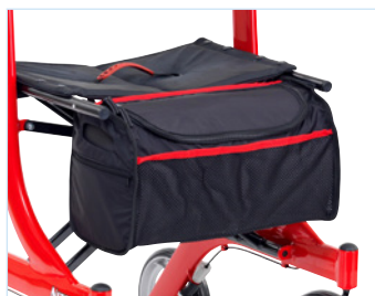
Removable zippered storage bag for storing essentials or shopping