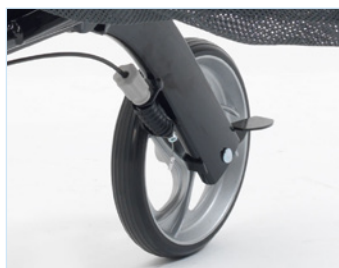
Rear stepper tube facilitates safe curb-climbing