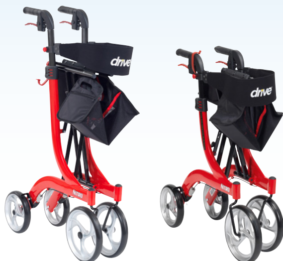
Easily folds with one hand to a compact size for storage and portability

The Nitro Rollators were developed with a contemporary design in mind, featuring a lightweight aluminium frame and stylish tri-spoke wheels for easy manoeuvrability.