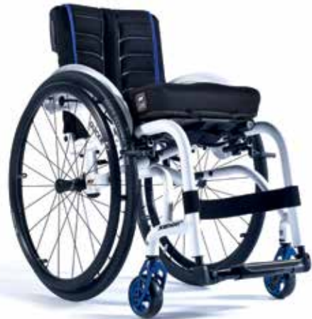
XENON ® HYBRID THE STRONGEST