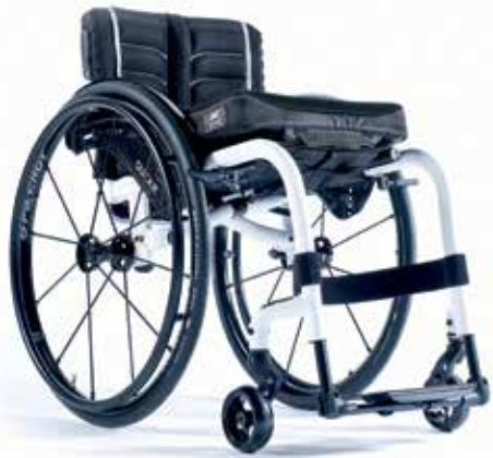
XENON ® FF THE LIGHTEST