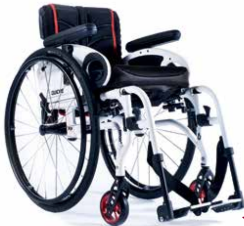
XENON ® SA THE ALLROUNDER